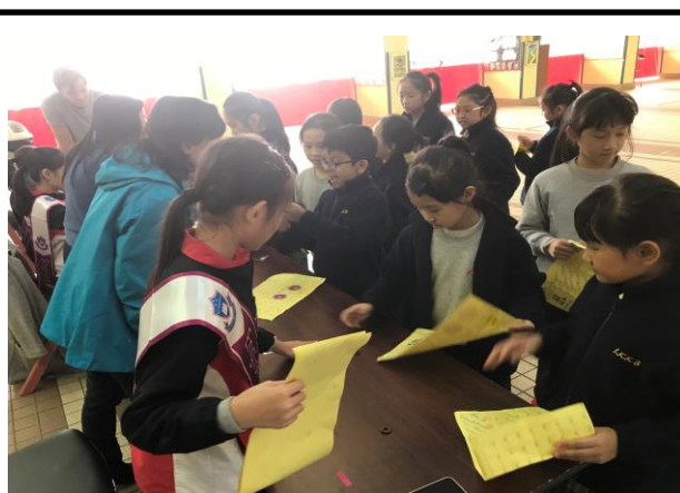
Integrating Science, Technology Engineering and Mathematics (STEM) into our activities. Students participate in an activity using magnets.