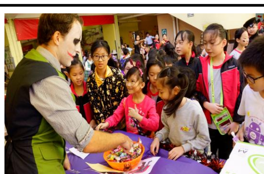
A big Halloween tent was set up in the playground where students could play games and use English to earn treats.

Our native English teachers help promote English Day activities during the recess and lunch break with our students. They also help to provide various topics through the campus TV. Our students do not only join the activities on the English Day, some of them are English ambassadors and helping teachers hold game booths or other activities too.