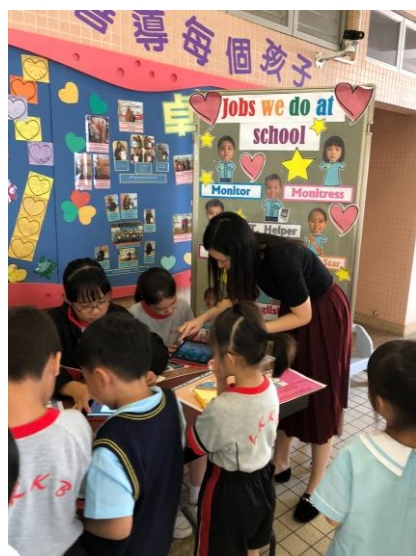
On English Day, our English ambassadors are committed to introducing games and helping in game booths.