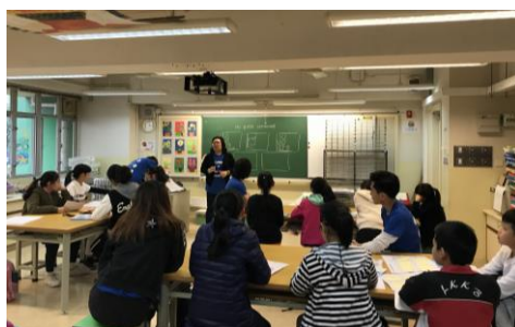
The instructor is showing some skills in drawing illustrations for a story.