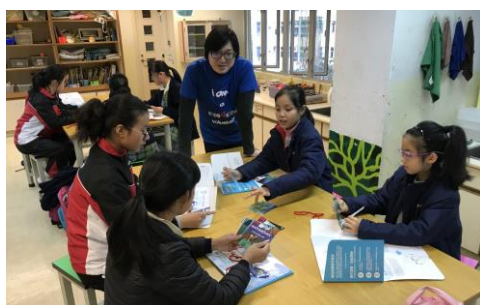
Students are using storyboarding technique to start planning their own stories.

About 20 students joined the workshop where Instructors from Kids4Kids guided students to turn their imagination into a story and then built the story in words and pictures.